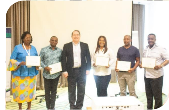
Power Purchase Agreement - Dubai -2023