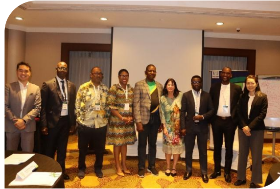
Transforming and Reshaping CLO, GC, and CS Portfolio - 2023- Singapore