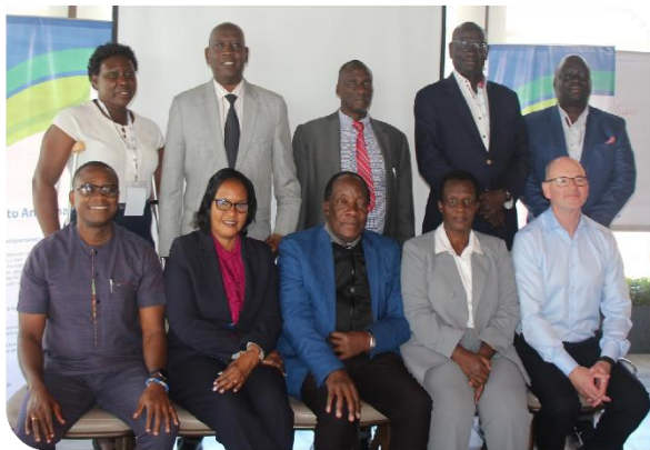
Corporate Governance – Turkey 2022