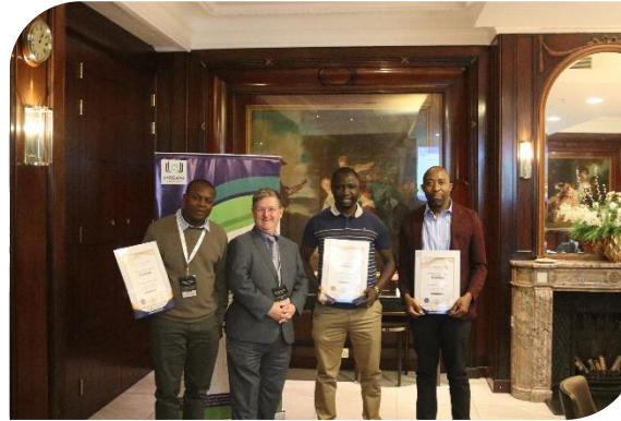
Sustainable Corporate Governance & Director Duties -2024 - London, United Kingdom