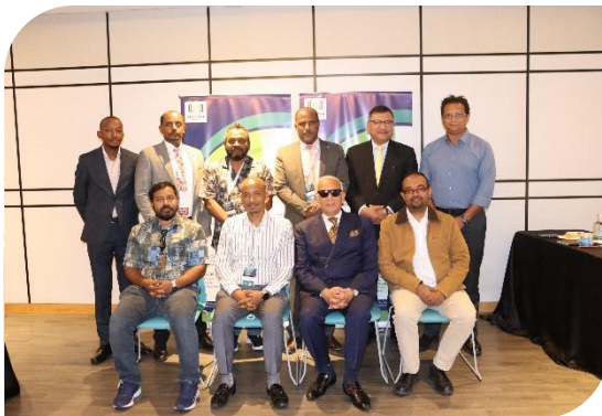
Advanced Strategic Finance Leadership - 2024 -Mauritius