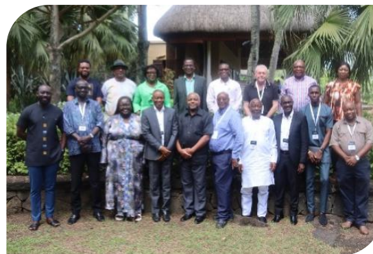
ESG In Corporate Governance -2024 - Mauritius