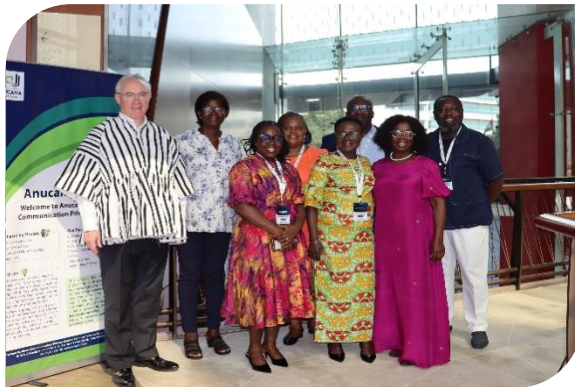
Cultural Transformation In Corporate Governance – 2024 - Dubai, UAE