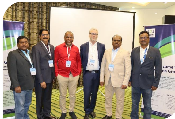
Health Safety Environment & Human Hazard - 2025 - Dubai, UAE