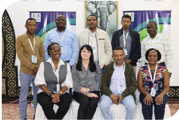
Advanced Retail Banking in the Digital World 2024 - Zanzibar, Tanzania