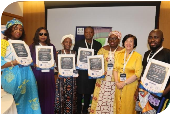
Transformative and Innovative Approaches of Risk Based Internal Auditing - 2024 - Dubai