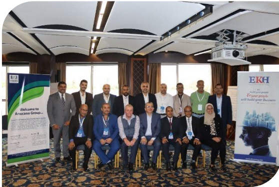
Risk Based Internal Audit - 2023 Cairo, Egypt