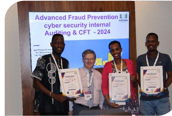
Advanced Fraud Prevention cyber security internal auditing and CFT - 2024 - Mauritius