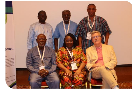
Corporate Governance & Board Best Practices - Dubai 2022