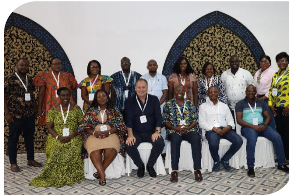
Advanced Retail Banking and Digitalization - 2025 - Zanzibar, Tanzania