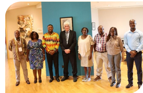
Transformational Financial Leadership Driving Value in High-Growth and Emerging Economies - 2025 - Dubai, UAE