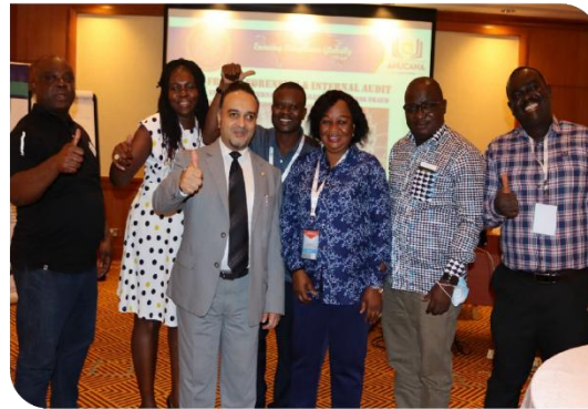
Fraud and Forensic Internal Auditing – Dubai 2022