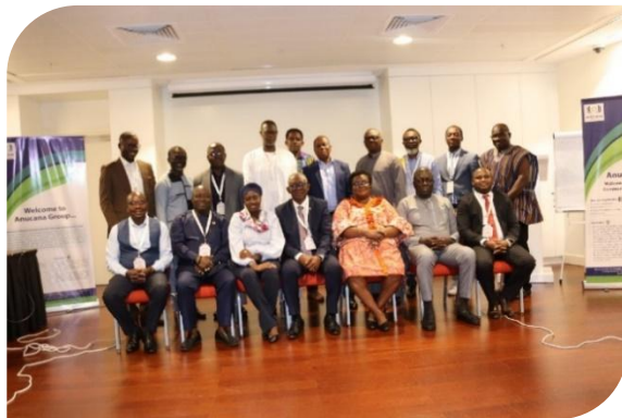
Advanced Infrastructure & Project Finance- 2024 -Kigali, Rwanda