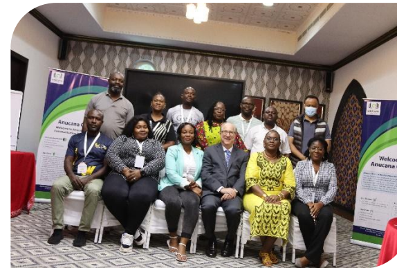
Non-Performing Assets and Loan Recovery - 2024 - Zanzibar, Tanzania