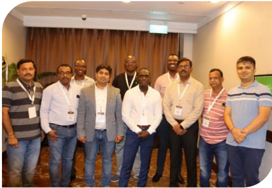
Global Health Safety & Environment For Mining - 2023- Singapore