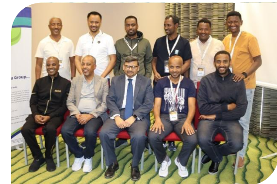
IFRS 17 with Practical Implementation - Dubai - 2023