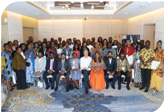
Energy Legal Masterclass Week 2023, Dubai