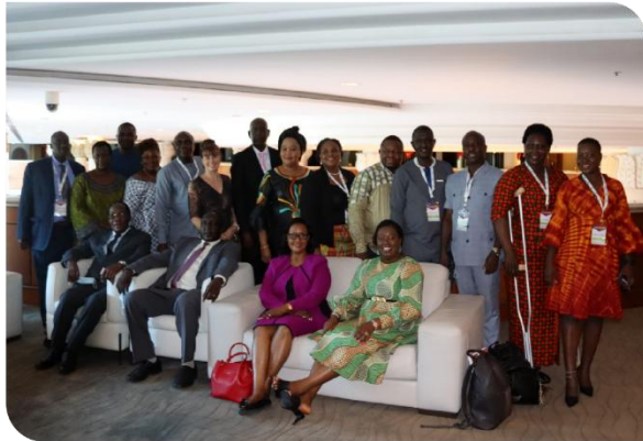
Corporate Governance – Dubai 2021