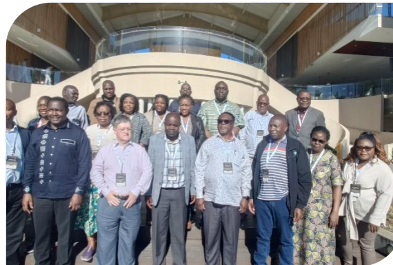
ESG Strategy & Governance - 2024- Mauritius