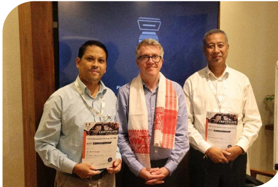
ESG in Corporate Governance - 2024, Mauritius