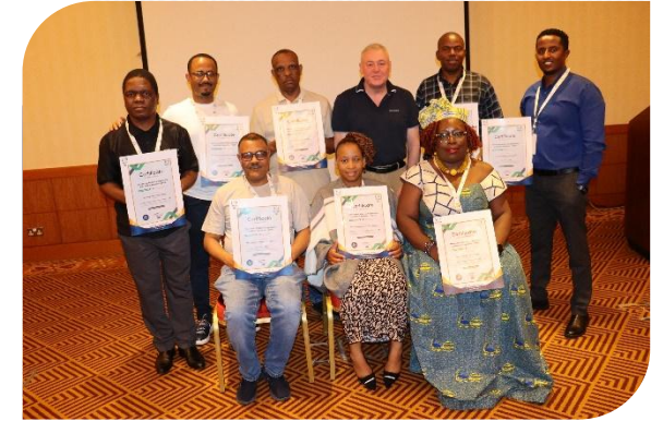
Advanced Risk Management and Risk Appetite – 2024- Dubai