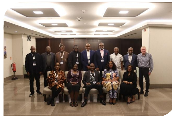
ESG in Corporate Governance and Induction of Directors - 2024 - Istanbul, Turkey