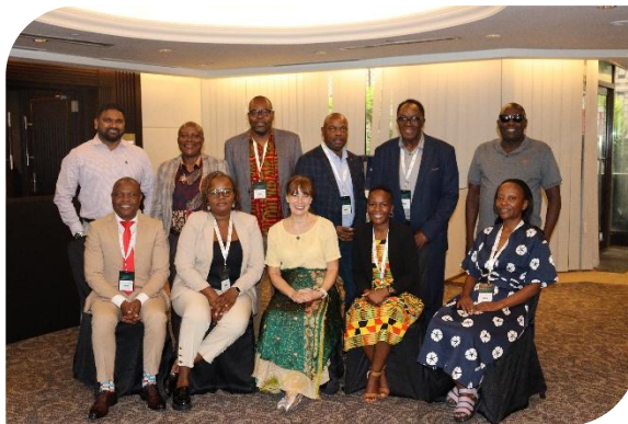
AI In Corporate Governance - 2025 - Kuala Lumpur, Malaysia