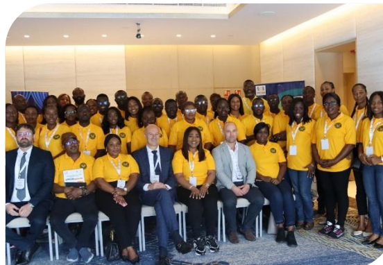
Advanced Retail Banking and Digital Transformation - South Africa -2023