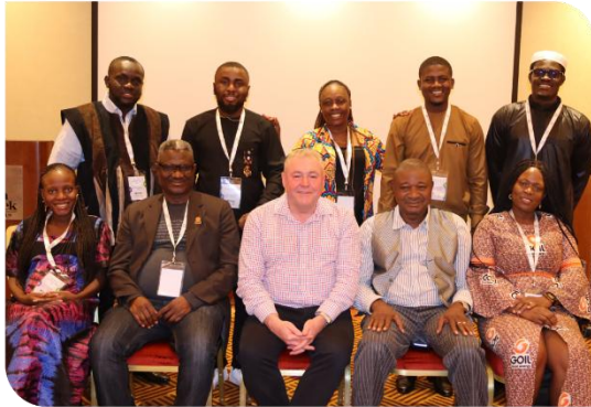
Risk Based Internal Audit - Dubai 2022