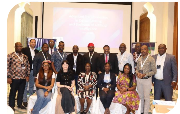
Advanced Transformation in Digital Banking and Evolution of Artificial Intelligence -2024- Zanzibar, Tanzania