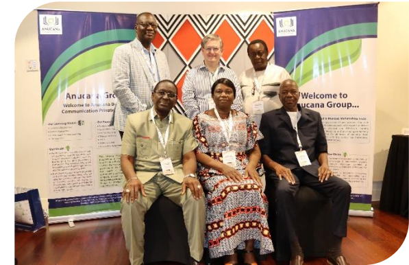
Advanced Retail Banking and Digitalization- 2025 - Kigali, Rwanda