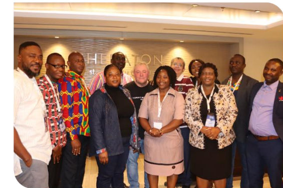
Risk Based Internal Audit – Turkey 2022