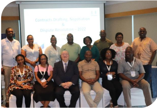
Contracts Drafting, Negotiation and Dispute Resolution - -Dubai, UAE