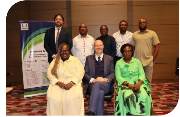
Advanced Force Majeure- 2024 -Doha, Qatar