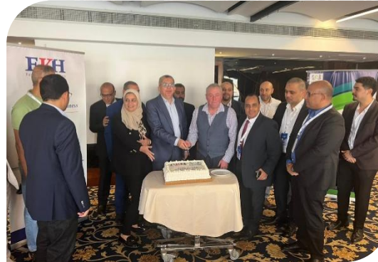
Global Health, Safety & Environment