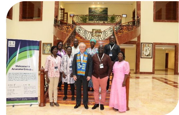
Change Management In Corporate Governance - 2024- Mumbai, India